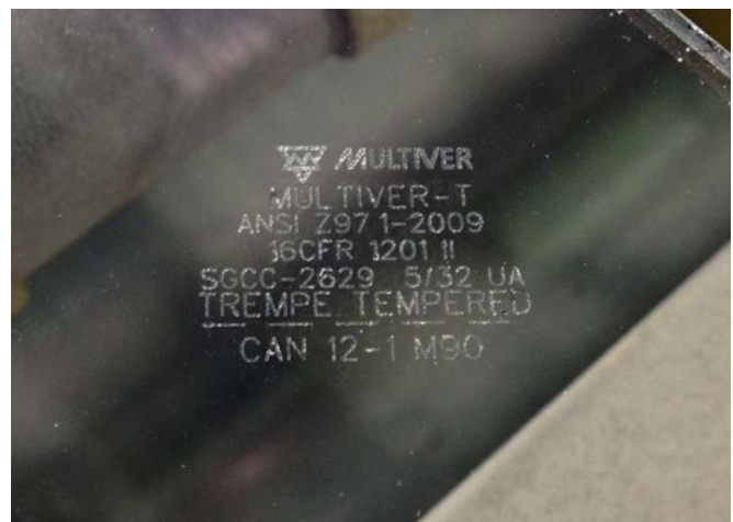
Multiver logo - Tempered glass

OPACI-COAT 300 spandrel glass must be either tempered or heat strengthened. You should therefore be able to see a laser engraved logo in one of the corners, unless it is covered. A date as well as the name of the company that tempered the glass should also be indicated.