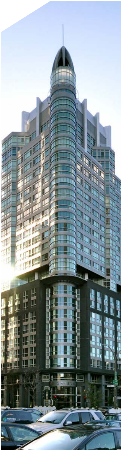
The Crystal hostel

Multiver has factories in Quebec City and Montreal and can therefore serve projects over a wide area and, in accordance with the distances required for this credit. In addition, Multiver offers several products including the production sites and places of extraction of the component materials are within the range allowed. For more information on eligible products, please contact one of our representatives.