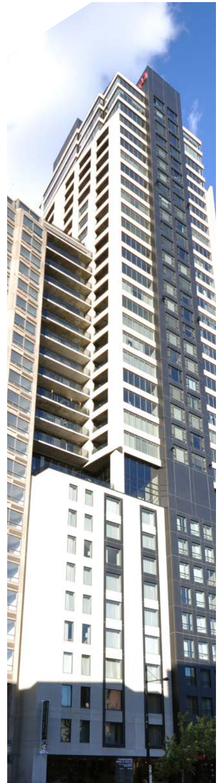
Hilton Garden Inn

Multiver has a wide selection of glazings with different levels of visible transmission that provide natural light in interior spaces. These products can meet the requirements of these credits without compromising energy performance. Our available glazings thus provide design flexibility for all types of projects. For more information and help choosing the right glazing that applies to your project, contact one of our representatives.