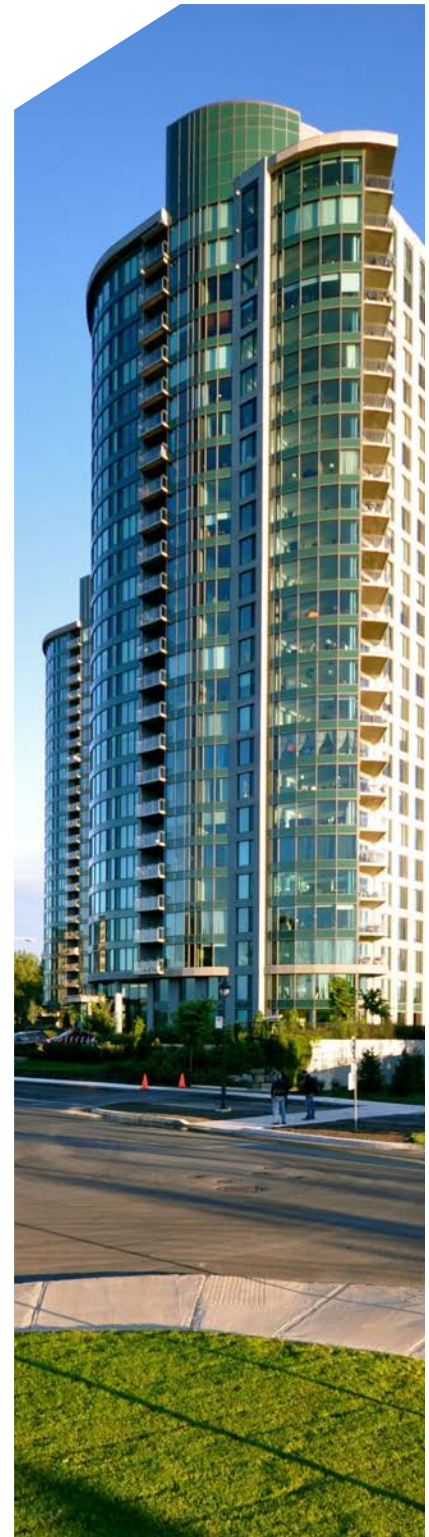
The Vistal 1 Condominium

Multiver provides an important range of glazing options that can help significantly reduce energy consumption of a building. Multiver glazings, in addition to help you achieve the LEED® requirements, are available in various colors to blend with your wanted design. Contact a Multiver representative who will help you determine which glazing is best for your project.