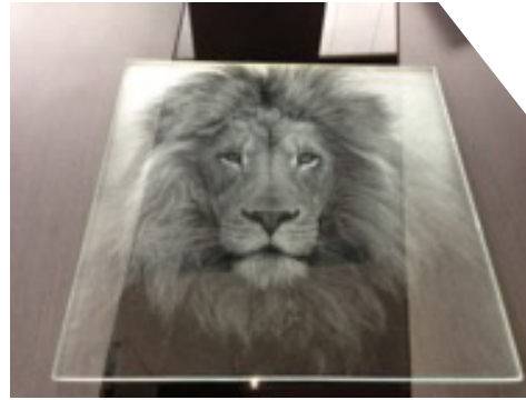
Finished product with M-ENGRAVING