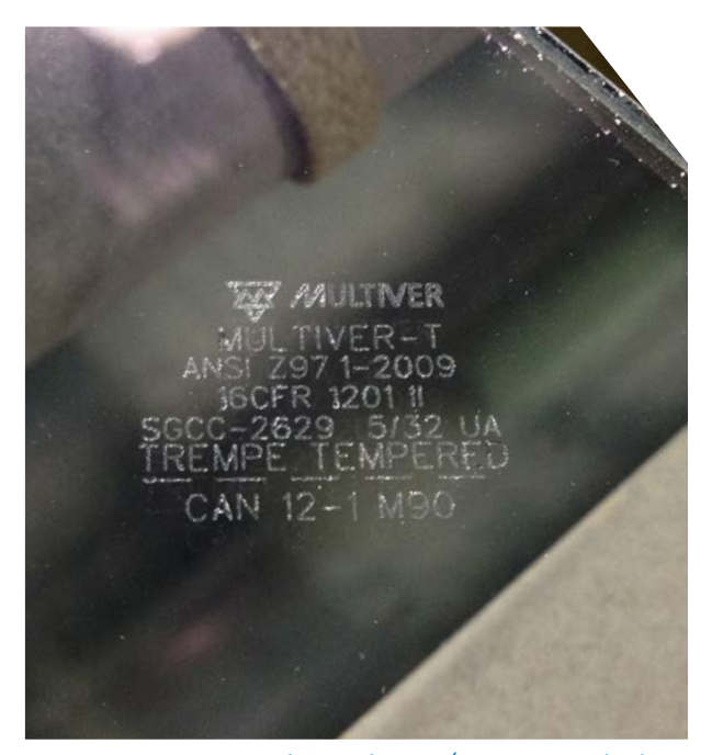
Multiver logo / Tempered glass

To prevent thermal stress breakage and increase the safety factor, glass can be heat-strengthened or tempered. A laser-engraved logo can be found in one of the corners of any tempered or heat-strengthened glass product.